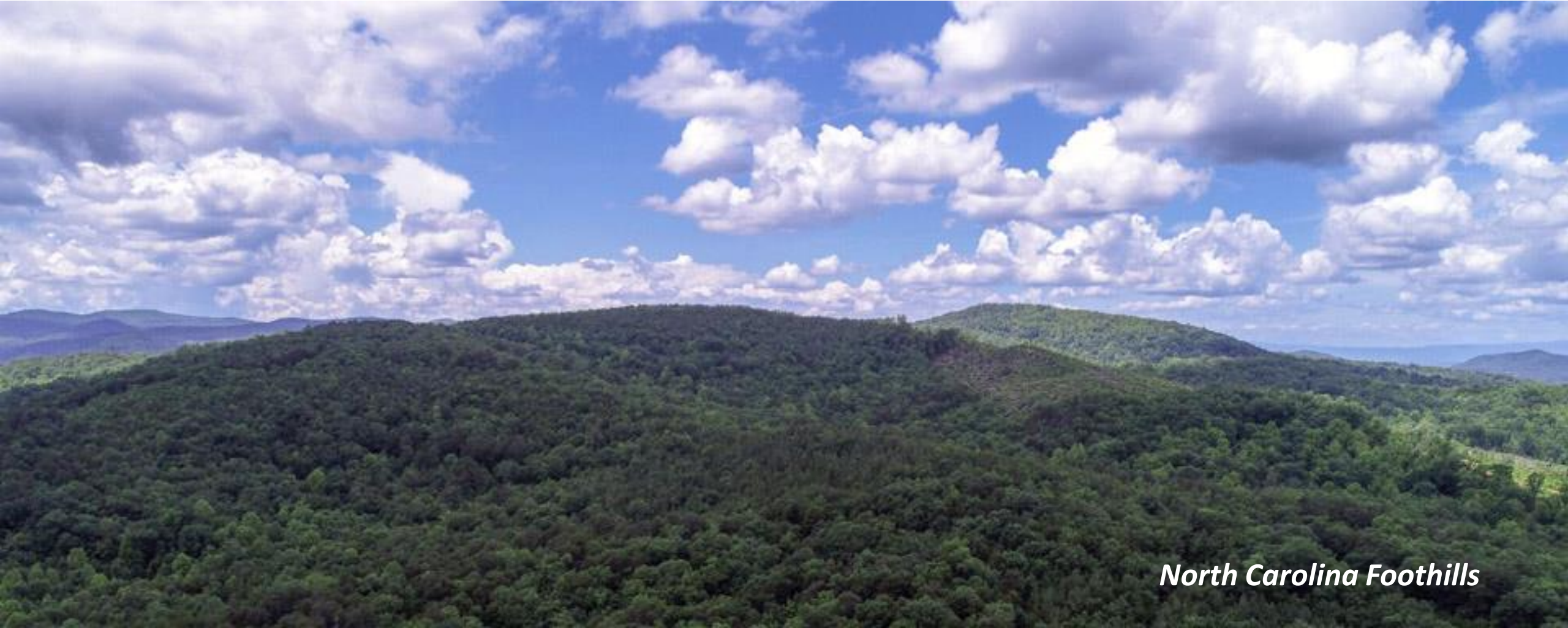
North Carolina Foothills