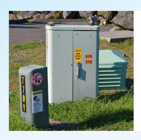
Evidence of unmarked utilities in the area