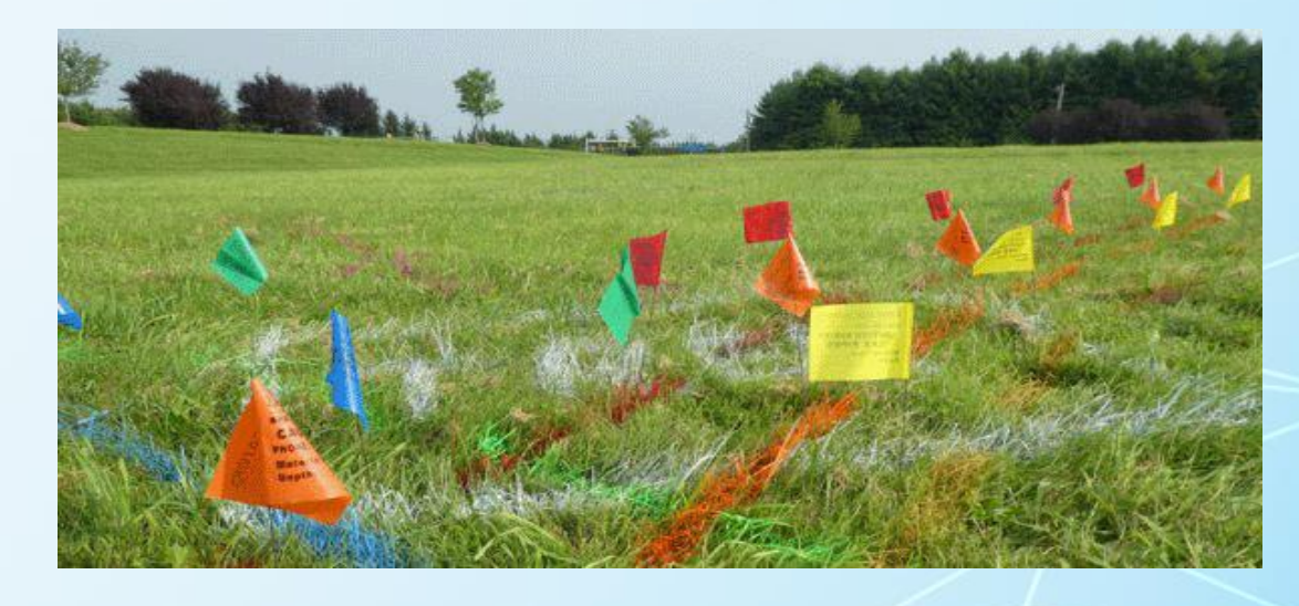
Area was located but markings have been destroyed due to weather, mowing, etc.