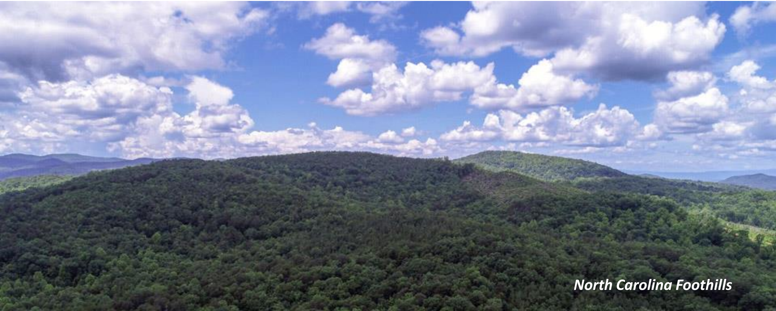
North Carolina Foothills