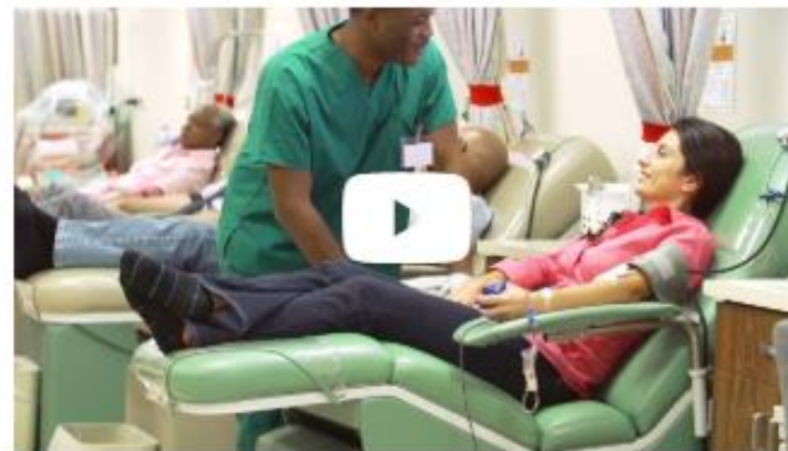
"We need people to start turning out in force to give blood." That

There is no known end date in this fight against coronavirus, and the Red Cross urgently needs the help of blood and platelet donors and blood drive hosts to meet the needs of patient care. Please schedule your next donation appointment now to help prevent another blood shortage.