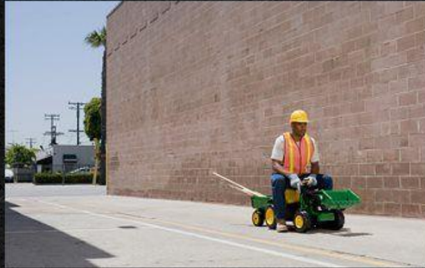
What my friends think I do