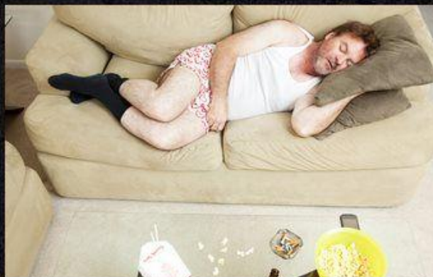
What my ex thinks I do