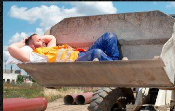
What my boss thinks I do