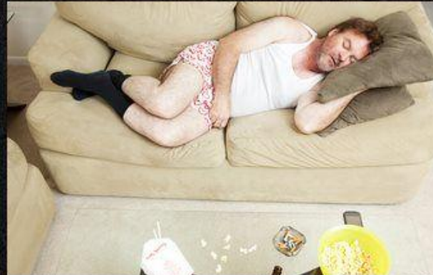
What my ex thinks I do