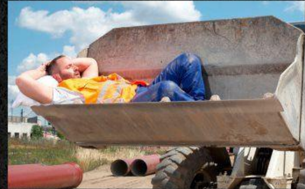
What my boss thinks I do