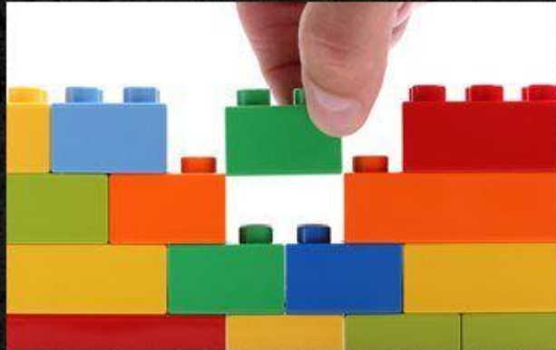
What my kid thinks I do